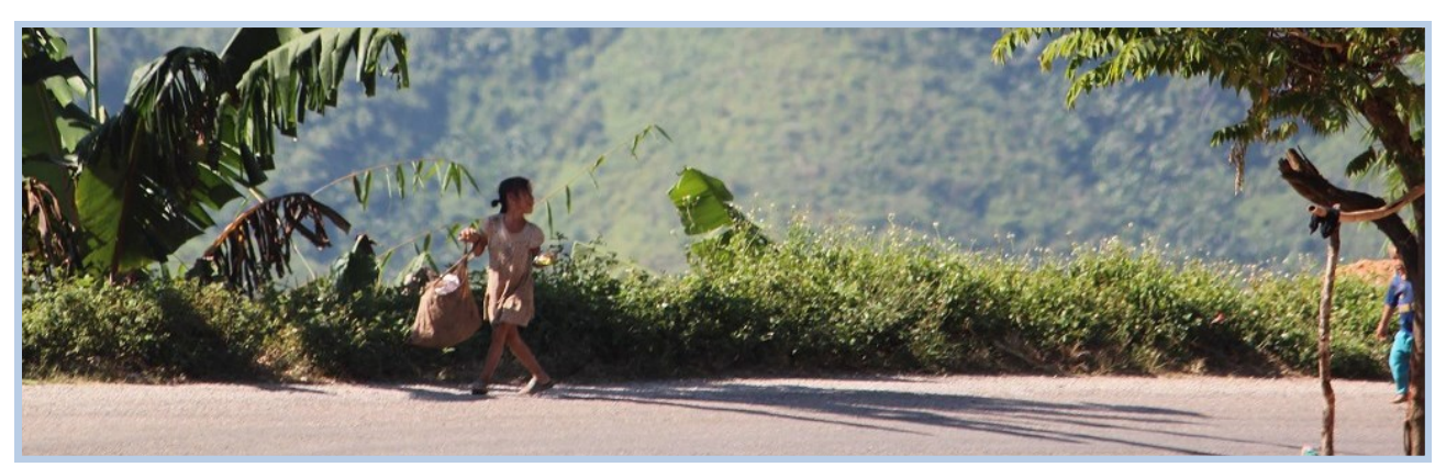
A young girl yells back to her friends; she has found a gift from foreigners that was tossed from a passing truck!

People are traveling more now than any time in history. Almost every hotel provides travelers with complementary travel sized shampoos and soaps. Some even provide a toothbrush, combs and razors. If you're like me, you know you paid for those products and you don't want them to go to waste, so you pack them in your suitcase and carry them home, just to throw them away a year later because you never followed through with your plan to use them.